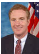
Chris Van Hollen - (D-MD)