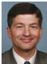
Rep. Jeb Hensarling - (R-TX)