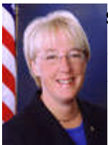
Sen. Patty Murray - (D-WA)