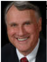
Sen. Jon Kyl - (R-AZ)