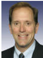
Rep. Dave Camp - (R-MI)