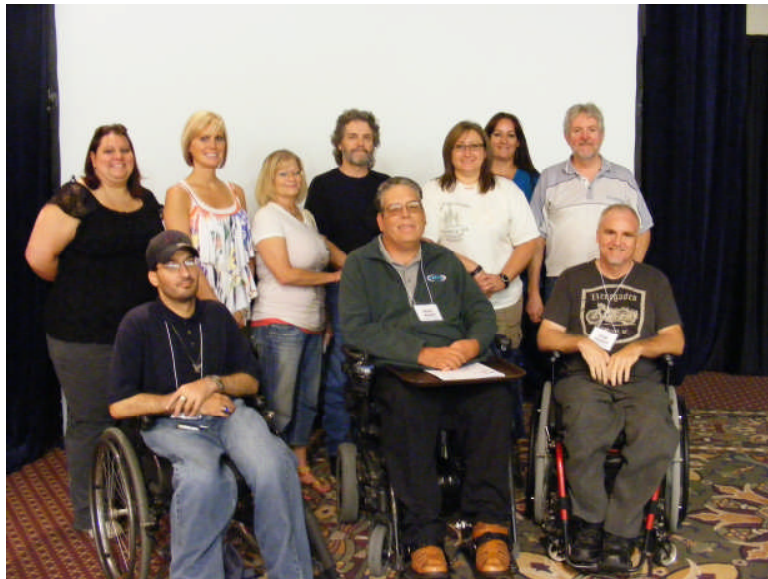
Recent Staff and Advocates at 2011 Disability Caucus