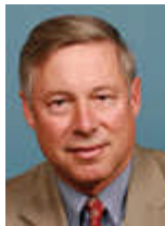
Rep. Fred Upton - (R-MI)