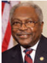
James Clyburn - (D-SC)