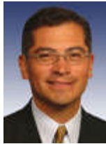
Rep. Xavier Becerra -