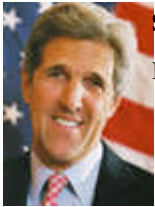
Sen. John Kerry - (D-MA)