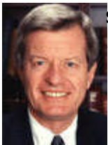
Sen. Max Baucus - (D-MT)