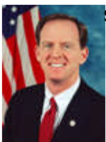
Sen. Pat Toomey - (R-PA)