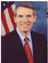
Sen. Rob Portman - (R-OH)